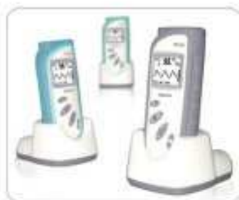
Battery charger stand

The latest 10 minutes trend graph and table of SpO 2 and Pulse Rate can be reviewed in the screen.